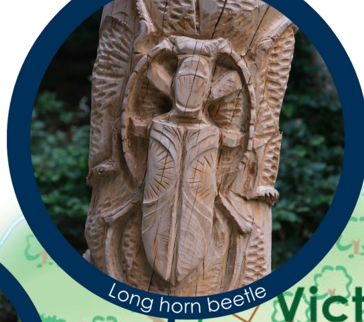
Long horn beetle